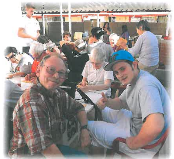
Boys Team Charity joins our friends for a day of fun at JRCH.