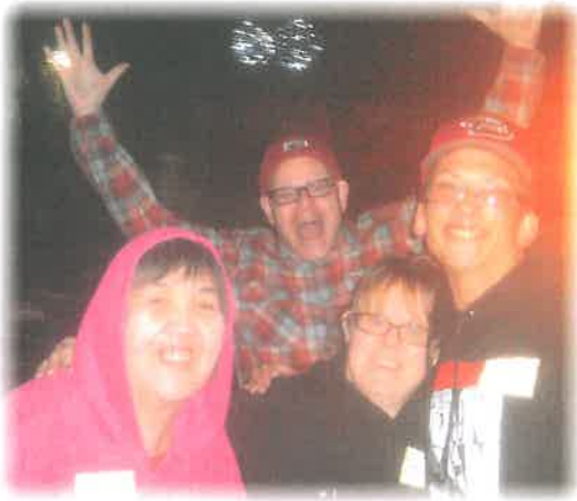
Board members spouses such as Chris get in on the fun of volunteering at this year's ZooLights