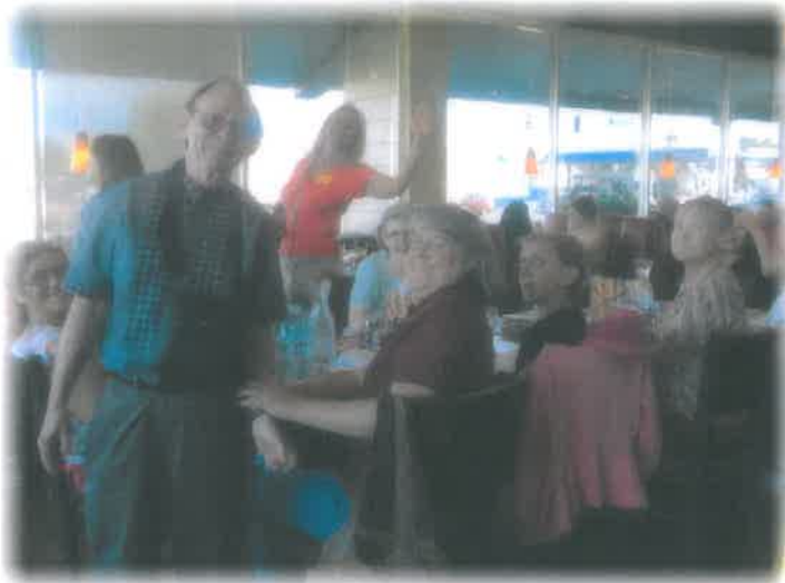
Ladies of Lynwood House enjoying dinner out at Denny's for Barney's Night