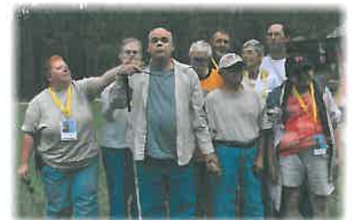
With such beautiful sites to see & weather during camp, these campers & volunteers couldn't pass up a chance to take a stroll in the wilderness.